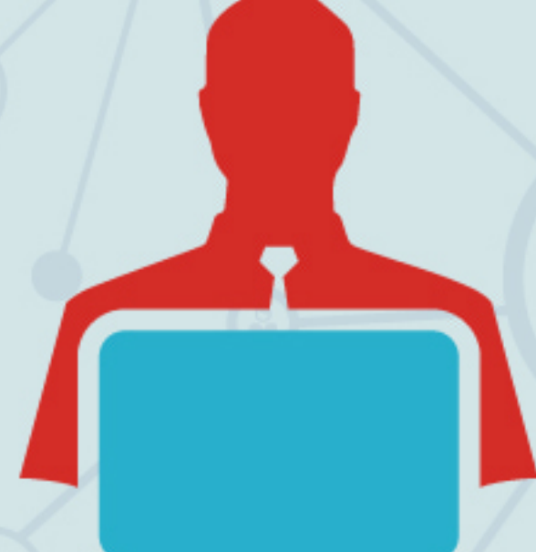
Figure Out how to IMPROVE it